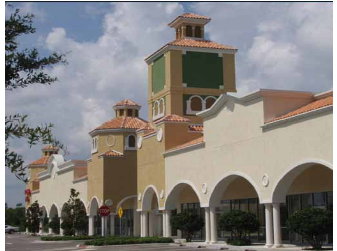
1740 Rinehart Rd., Sanford, FL. 32771