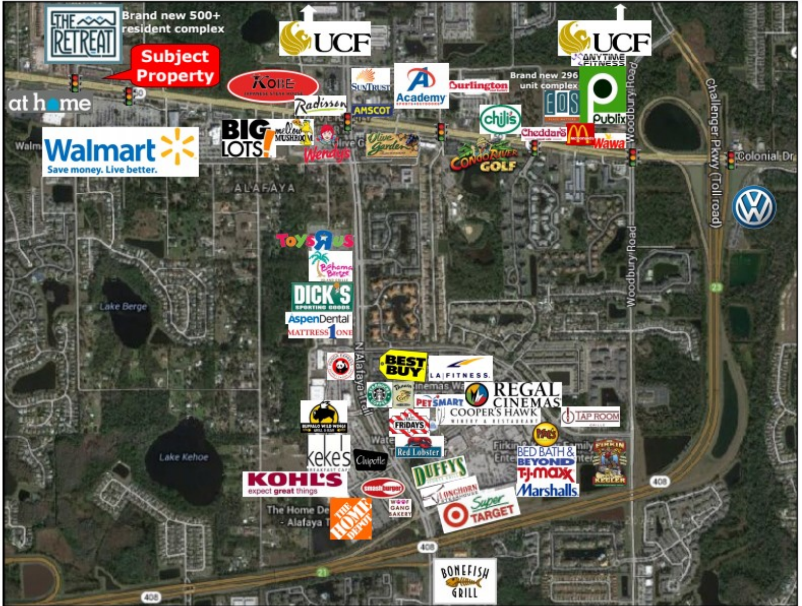
Area Retailer Map

T: 954.608-5053 www.RealPropertySpecialists.com