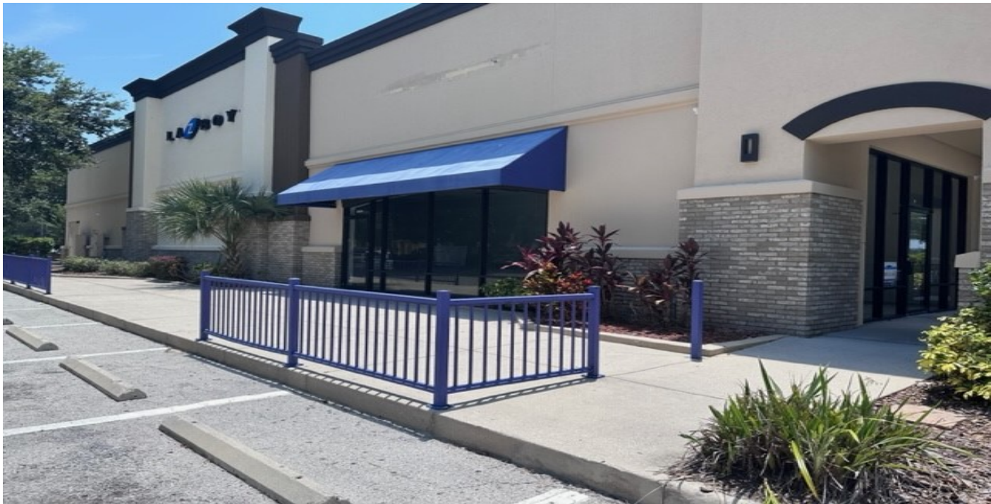
Patio / Outside Seating Area