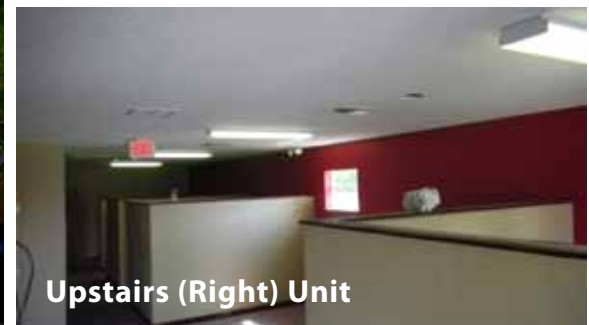
Upstairs (Right) Unit