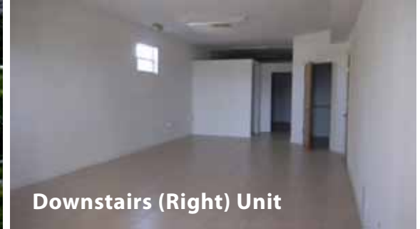
Downstairs (Right) Unit